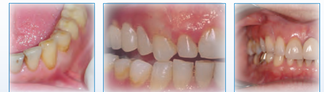
Valplast® is made from a translucent nylon material that blends in with your natural gum tissues to become virtually invisible when placed in the mouth.

Millions of patients have already discovered the benefits of wearing a Valplast Flexible Partial. Ask your dentist about Valplast today!